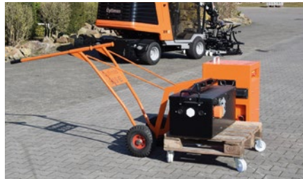
Battery transport cart, Exchange lithium-ion battery, External charger