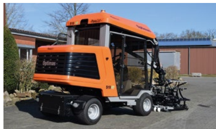
Optimas S19E PaveJet