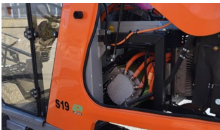
Electric motor 14 / 23 kW 48 Volt

placed by a full battery within a few minutes. Because of the short charging times with the external charger, continuous work is guaranteed.